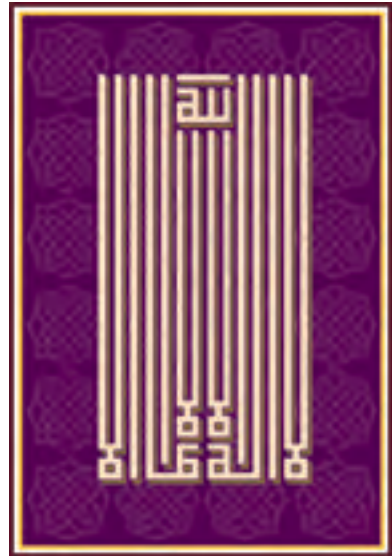
Calligraphic example of "There is none worthy of worship but God"

For example, the construction of the human eye bears testimony that its Creator is fully conversant with the laws of optics; the composition of human blood with fixed proportions of its composite elements shows that its Maker is well aware of the required chemical balance; the design of the Solar System, particularly the relationship between the size, distance, and speed of each planet, is proof that its Designer is aware of the details of the Law of Gravity and the effects of circular motion producing centripetal forces.