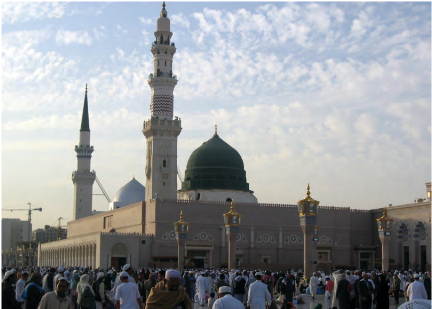
Mausoleum of The Holy Prophet Muḥammad (PBUH) in Medina, Saudi Arabia

The Holy Prophet (PBUH) then began to spread the message of Islām, first to his close family, later to the people of Mecca.