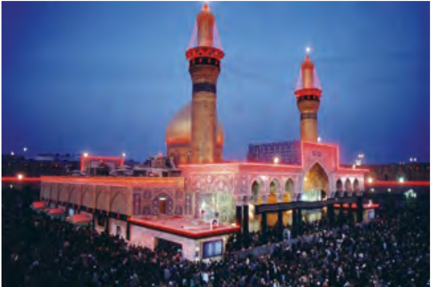
Mausoleum of Imām Ḥusayn (PBUH) in Kerbala, Iraq

In Islām, the first month of the lunar calendar is called Muharram. Every year, Shīʿahs around the world gather together in their respective centres to commemorate the tragedy of Kerbalā. Over 13 centuries ago, the grandson of the Holy Prophet (PBUH) and several family members and companions were martyred on the burning plains of Kerbalā, Iraq. After the death of Ḥasan son of ʿAlī (PBUH), the second Imām and grandson of the Holy Prophet (PBUH), the Imāmat was bestowed upon his brother Ḥusayn (PBUH).