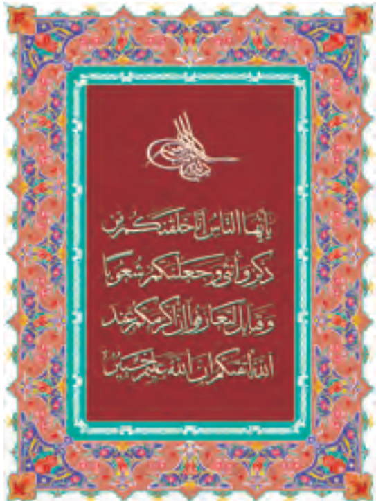
Chapter 49 (Al-Ḥujurāt, The Chambers), Verse 13 from the Qur’ān

The Qur’ān is the holy book of Islām. The Qur’ān was revealed in °Arabic, the language of the people in Arabia at the time, to the Holy Prophet Muḥammad (PBUH). It was revealed in stages over twenty three years of