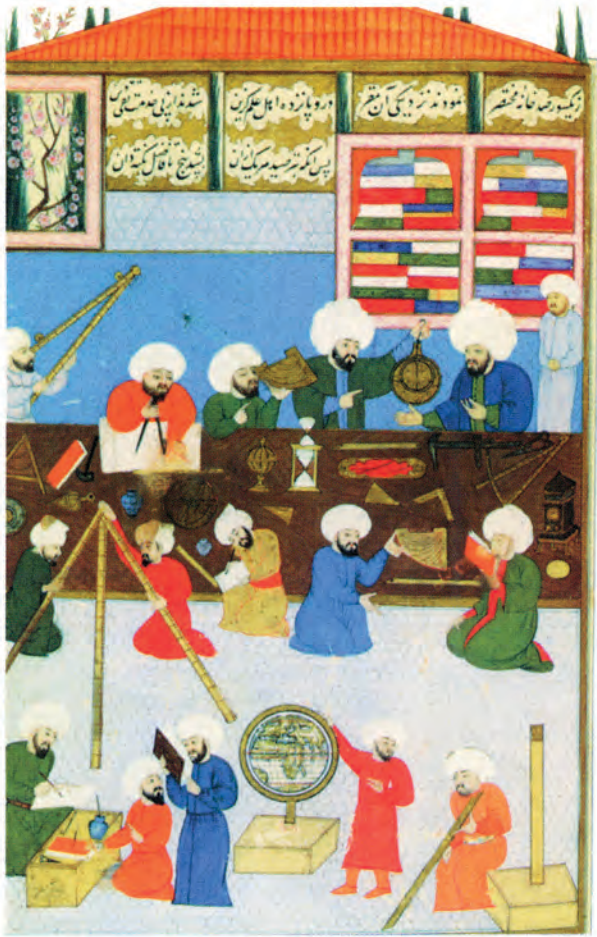
Muslim astronomers at work in an observatory, from an Ottoman manuscript

The Qur'ān itself mentions many scientific miracles, including the embryological development of the human foetus, the concept of the Solar System, and the water cycle. Clearly Islām and Science are quite harmonious.