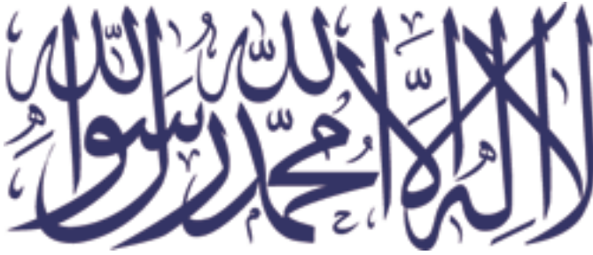
Calligraphic example of the Shahādah (Testimony)

All Muslims believe in reciting the Shahādah (Testimony), in which they bear witness to the fact that there is none worthy of worship but God, and that Muḥammad (PBUH) is His messenger. This testimony reiterates the fundamental beliefs of all Muslims about submission to the will of God and following His chosen messenger.