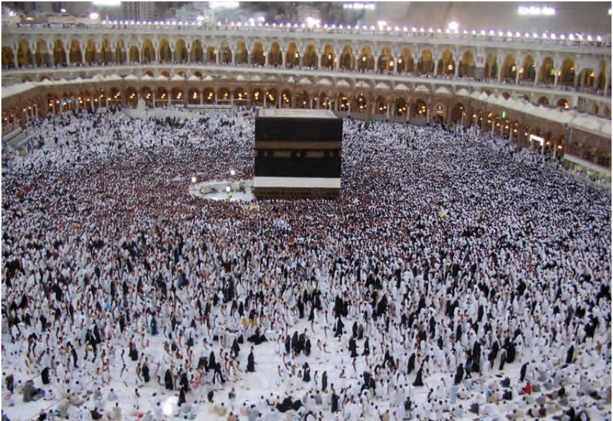
The Ka c ba