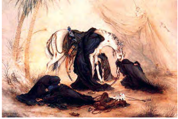
Artistic rendition of the camp of Imām Ḥusayn (PBUH) immediately after his death

“In the history of Islam, specially the life of Imam Husain stands unique, unapproached and unapproachable by anyone. Without his martyrdom, Islam would have extinguished long ago. He was the savior of Islam and it was due to his martyrdom that Islam took such a deep root, which is neither possible nor even imaginable to destroy now.” He also writes, “In a distant age and climate, the tragic scene of the death of Husain will awaken the sympathy of the coldest reader.”