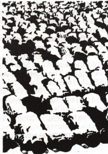
'Abd al-Husayn Sharaf al-Din al-Mūsawī

had sent an emissary to invite the Shahid to Khurasan, but the latter, probably considering his local responsibilities, declined. Instead, the Shahid wrote al-Lum'a ad-Dimishqiyyah and dedicated it to al-Muayyad.